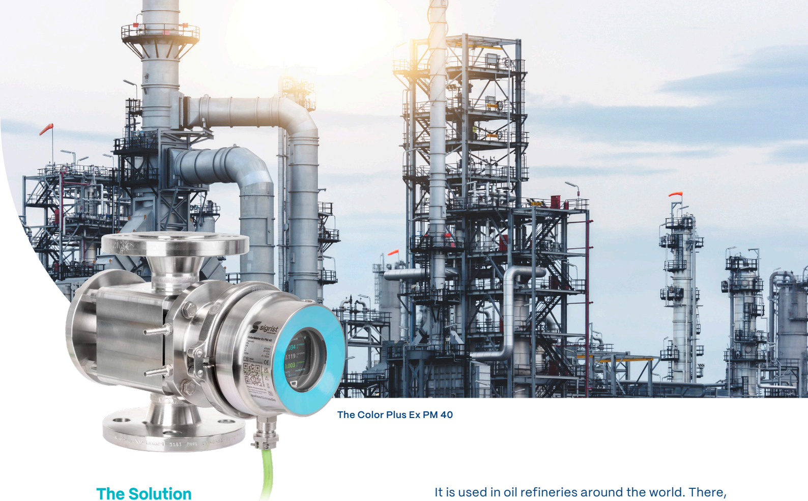
The Color Plus Ex PM 40