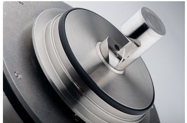
Sensorkopf PhaseGuard C