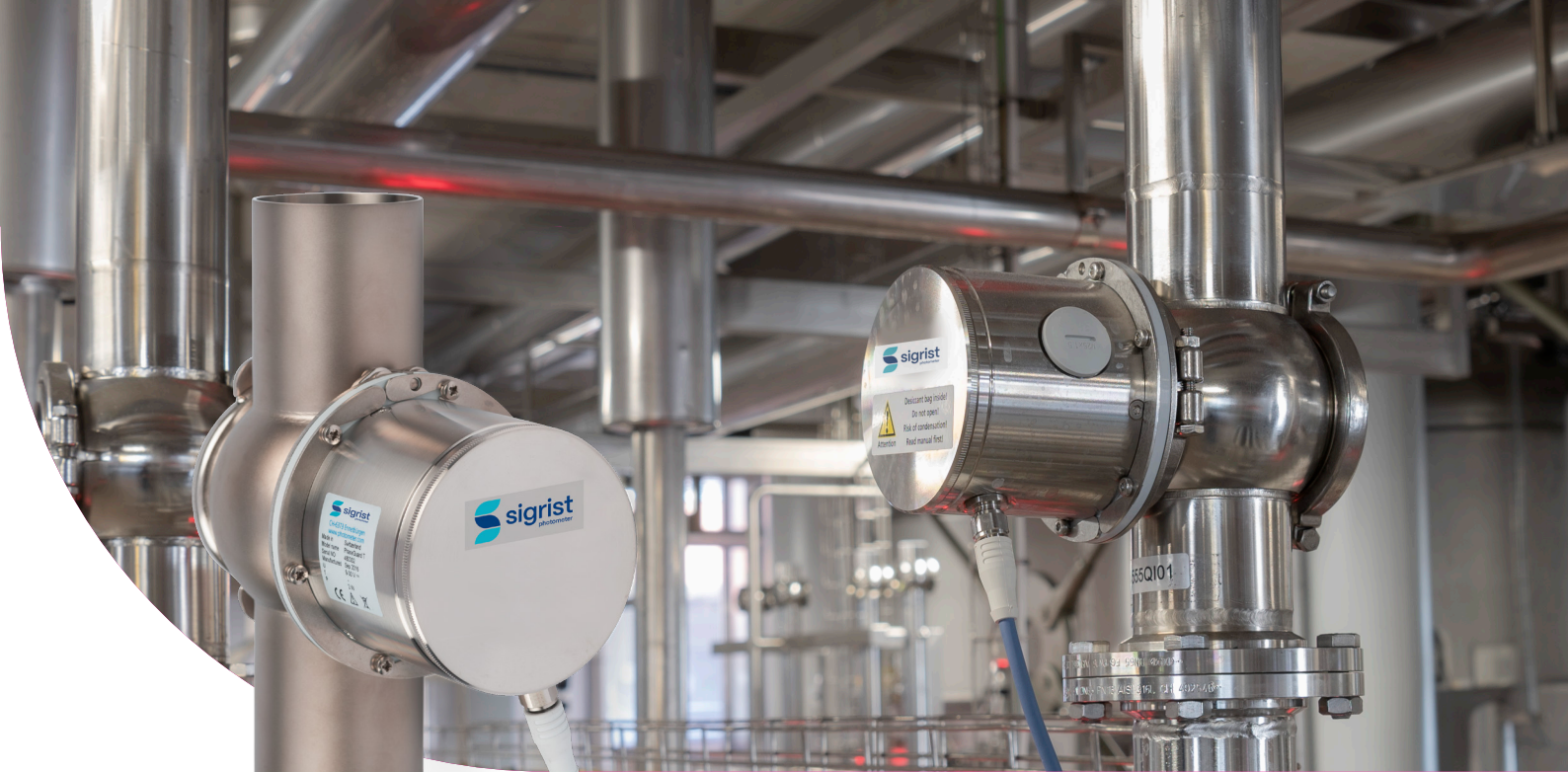
The PhaseGuard in Varivent housing