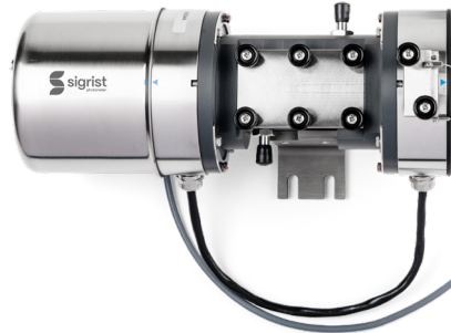
AquaScat 2 P