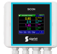
ColorPlus 2 SAK with SiCon